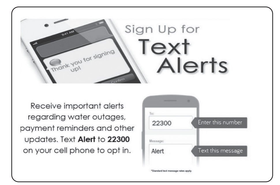
In order to receive text notifications you will need to opt in for text messaging. This is optional, we will continue to send out voice notifications if you do not sign up. If you would like to receive text message notifications, text the word, Alert, to the number 22300."